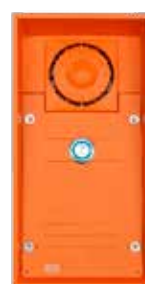
2N® Analog Safety