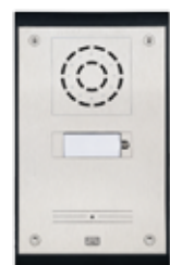
2N® Analog Uni