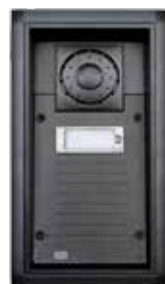
2N® Analog Force

Using the services of the existing analog exchange not only saves costs on a new solution, but also offers a better quality and wider range of services, e.g. out-of-office redirect (to another office, voicemail, etc.) or putting a call through (e.g. from the secretariat to a particular person).