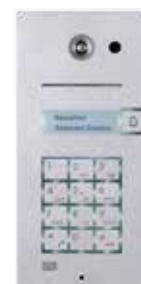
2N® Analog Vario