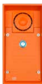
2N® Analog Safety