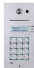
2N® Analog Vario